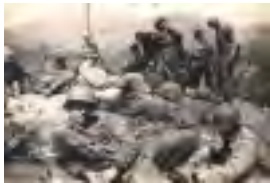
A supply-bearer party arrives at the unit. Goulet and Sin Gin Sup are in the foreground, with Al Rothrock reclining next to the tree.