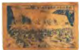
UN propaganda leaflet targeting Chinese soldiers. (This image is considered to be in the public domain.)