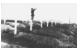
Years after the war, a buddy sent this photo of the Marine Cemetery at Hungnam. Goulet's caption reads "my platoon was staying in an abandoned building across the road, between Hamhung and Hungnam." They were soon evacuated from North Korea.