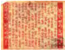
UN propaganda leaflet targeting North Korean soldiers. (This image is considered to be in the public domain.)