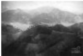
The tough mountain spines of the Korean terrain. Note the extensive clearing for agricultural work.