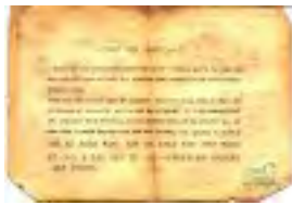
Communist propaganda leaflet – Safe Conduct Pass. (This image is considered to be in the public domain.)