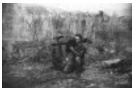
A 55 millimeter recoilless rifle and its crew, attached to Goulet's platoon.