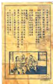
UN propaganda leaflet targeting Chinese soldiers. (This image is considered to be in the public domain.)