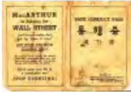
Communist propaganda leaflet – Safe Conduct Pass. (This image is considered to be in the public domain.)