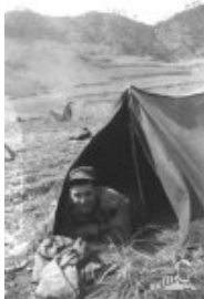
"Andy Angelastro's pad," reads the caption.