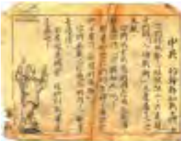
UN propaganda leaflet targeting Chinese soldiers. (This image is considered to be in the public domain.)