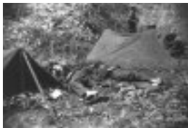
"Airing those barking dogs," writes Goulet. GIs catch some sleep after a march.