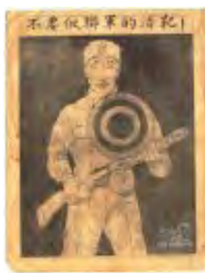
UN propaganda leaflet targeting Chinese soldiers. (This image is considered to be in the public domain.)