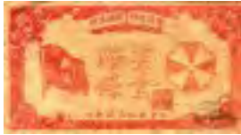
UN Safe Conduct Pass. (This image is considered to be in the public domain.)