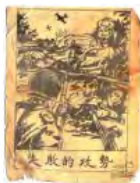
UN propaganda leaflet targeting Chinese soldiers. (This image is considered to be in the public domain.)