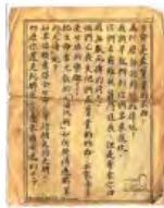
UN propaganda leaflet targeting Chinese soldiers. (This image is considered to be in the public domain.)