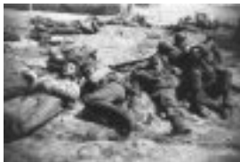
Andy Angelestro, unknown, 'Combat' Raines and Barton catch up on some much needed sleep.