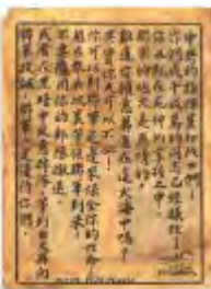
UN propaganda leaflet targeting Chinese soldiers. (This image is considered to be in the public domain.)