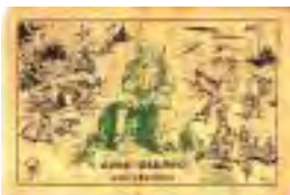
UN propaganda leaflet targeting Chinese soldiers. (This image is considered to be in the public domain.)