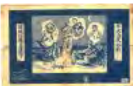
UN propaganda leaflet targeting Chinese soldiers. (This image is considered to be in the public domain.)