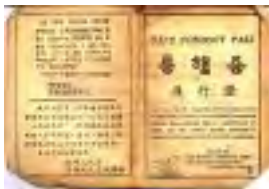
Communist propaganda leaflet – Safe Conduct Pass. (This image is considered to be in the public domain.)