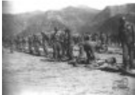
The unit goes through an equipment inspection while in the rear.