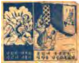
UN propaganda leaflet targeting North Korean soldiers. (This image is considered to be in the public domain.)