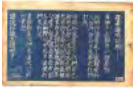
UN propaganda leaflet targeting Chinese soldiers. (This image is considered to be in the public domain.)