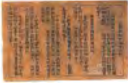
UN propaganda leaflet targeting Chinese soldiers. (This image is considered to be in the public domain.)