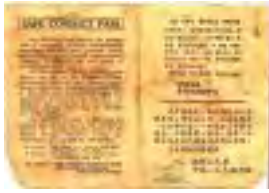
Communist propaganda leaflet – Safe Conduct Pass. (This image is considered to be in the public domain.)