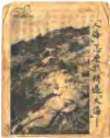
UN propaganda leaflet targeting Chinese soldiers. (This image is considered to be in the public domain.)