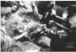
Soldiers share a Five-In-One ration, with the empty ration box in the rear.