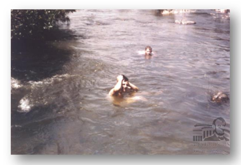
Getting a bath in a stream was extremely rare. Elaborate security had to be set up for men to relax and enjoy themselves briefly.

the soldier was up in a tree. I said. "What are you doing up in the tree?" And he said. "Watch." so he jumped down—it was fifteen feet or sojumped down. I said, "What