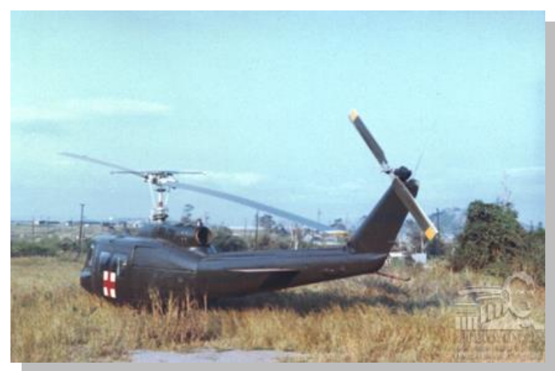
Huey helicopters were the standard dust off choppers in all of Vietnam. They were prominently marked as such, but that certainly didn't stop enemy fire.

would shoot at anything, just virtually anything. You wouldn't think that a lot of times our choppers were armed. but they were. They were armed just like other Huey choppers. We had two sixty caliber