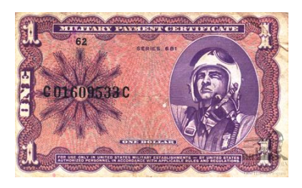
"Upon arriving in Vietnam, all of the soldiers' American money was taken, except pennies. The money given to them in return was called Military Payment Certificates. There were different bills for all denominations."

I went over to the medics table, and I was standing there. There you're assigned to