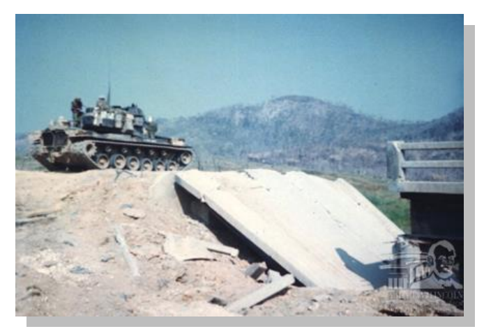
This was one of our tanks on duty guarding this bridge. Obviously, they were a little late.

Anyway, the tanks would sort of sit beside the road or on bridges, which were important targets for security because every doggone bridge we had,