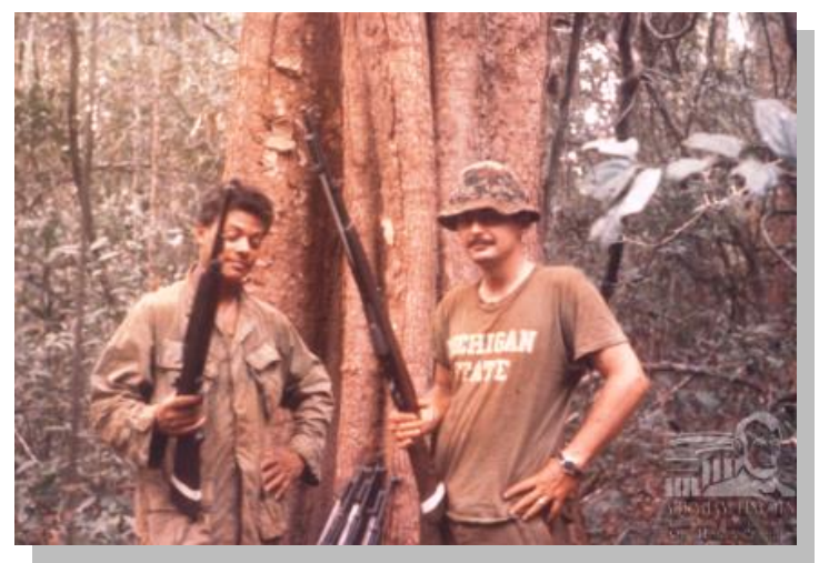
Some of the captured weapons in the early days of the Cambodian invasion, when large amounts of military materials were captured. As long as they were not "automatic weapons," they could be taken home as souvenirs.

Phillips: Yeah, yeah. Once we went through the base and secured it, we left some people there to sort of catalog what was all there and what was captured. They had trucks and all kinds of cases of ammo and weapons, all kinds of stuff we don't normally see, large amounts of it. So we left some people there. I'm not sure what they did with it, whether they blew it up or took it back with them or