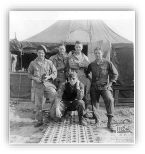
The 327th was stationed at Camp Detroit in Laon, France while they waited for the orders to ship to the Pacific for the invasion of Japan during the summer of 1945.